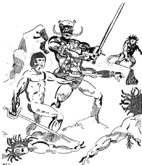
JOHN CARTER, TARS TARKAS AND THE PLANT MEN OF BARSOOM

The complex moral codes, desert environment, and light swords of the Red Planet have all contributed to giving Barsoomian combat a feel that is somewhat different than that of the traditional OD&D world.