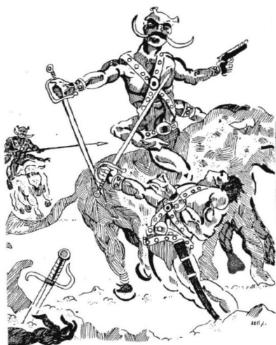
GREEN AND RED WARRIORS BATTLE ON BARSOOM

Percent chance is the same per level as the Mesmerist or Telepath.