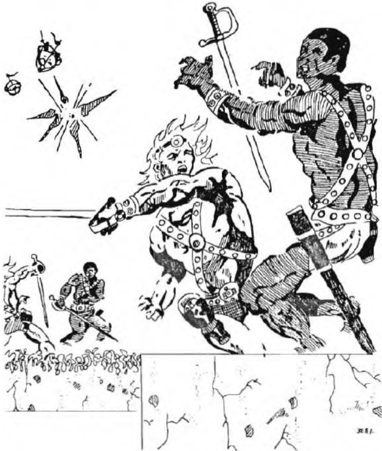
BLACK PIRATES AND THERNS BATTLE IN THE VALLEY DOR

3. Jahar and Helium are at war (yet again)! The characters enlist in the Navy and are sent out across the sands to battle the foe. Will they win glory as expert pilots? Sneak behind enemy lines and gather vital information? Attempt to take the great Citadel of Jahar against overwhelming odds? Perhaps they discover the warriors of Jahar are not that different from those of Helium.