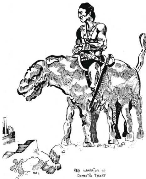
RED WARRIOR ON DOMESTIC THOAT